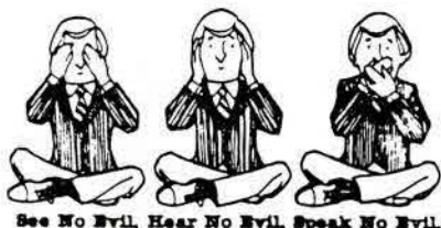
See No Evil, Hear No Evil, Speak No Evil.

Their solution was to COVER the SIN of their father so that no one else could know about it. They hid it. They remind me of the molded figures of the three little monkeys that my natural father purchased for our mantel when I was a little tot. I remember that one had his eyes covered, another had his hands over his ears, and the last had his hands over his mouth. Molded into the base of the figures were the words, "See no evil, hear no evil, speak no evil." You may remember having seen one like it.